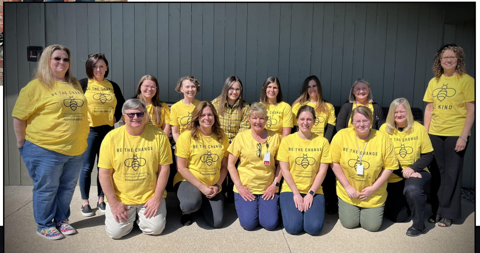
Bee the Change: The board staff were shining BRIGHT for Clinton County Developmental Disabilities Awareness Day!