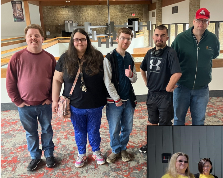
People First: The Fayette County advocacy group (F.A.C.T.) attended the People First of Ohio Advocacy Conference. They learned about charting a life course and serving on county boards.