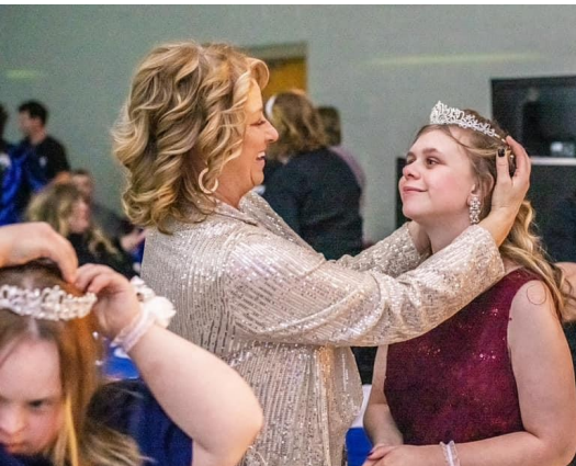
Crowning Event: Over 500 people attended the Brown County Night to Shine.